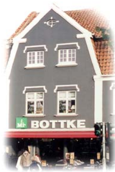
BOTTKE STORE FRONT: Someplace in Germany, perhaps in Duesseldorf.