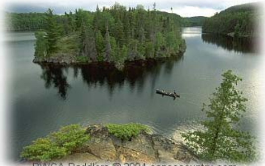
BWCA Paddlers

2329 Chestnut Way <> Bedford Tx. <> 76022 <> Email: marvcarole@comcast.net <>